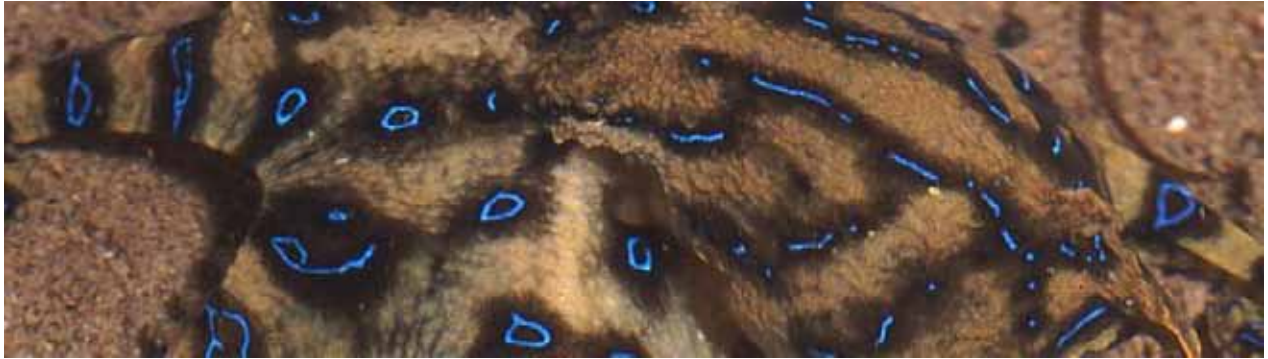
Blue-ringed Octopus.