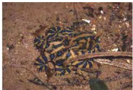
Irritated Blue-ringed Octopus flashing its warning colours.

Difficulty in seeing or speaking is often followed by trouble with breathing and sometimes vomiting. Weakness and lack of coordination usually progress to paralysis, which may last from four to twelve hours. If resuscitation is not given when breathing difficulty and paralysis begin, the victim will fall unconscious and die from lack of oxygen. Death can occur within thirty minutes.