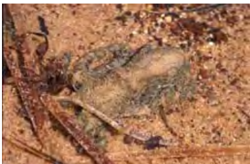
Well-camouflaged, resting Blue-ringed Octopus.

Hapalochlaena species are carnivorous and use powerful venom to immobilize their prey. Two large salivary glands provide venom via the salivary duct to the mouth, which possesses two beak-like jaws. There are no fangs and the venom enters the wound as saliva, rather than being injected. The venom contains two toxins: maculotoxin, which is very similar, if not identical to tetrodotoxin (present in the flesh of many poisonous fish, e.g. Toad or Puffer Fish); and hapalotoxin, which is less toxic to humans, but possibly of greater importance for the capture of prey. It has been suggested that maculotoxin has a defensive role against predatory fish as it does not affect crabs, the usual prey.